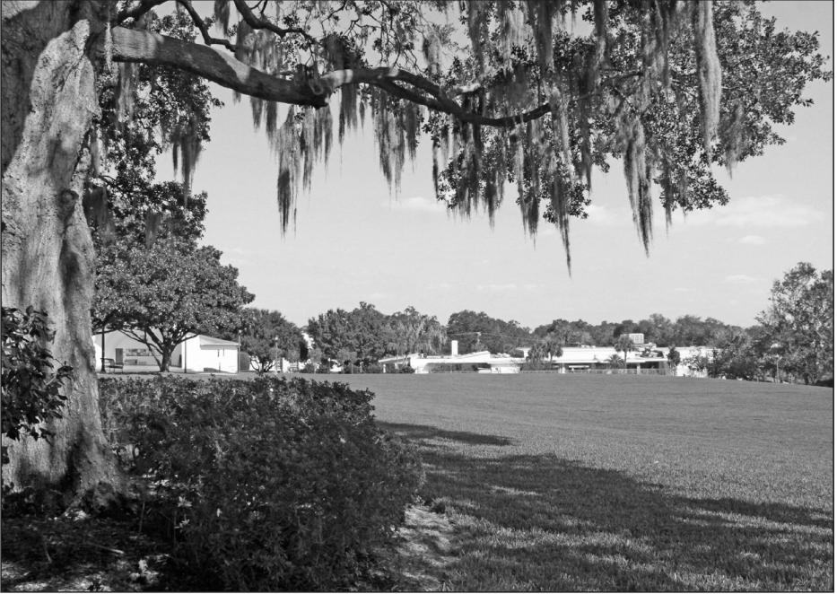
Mr. George's Green