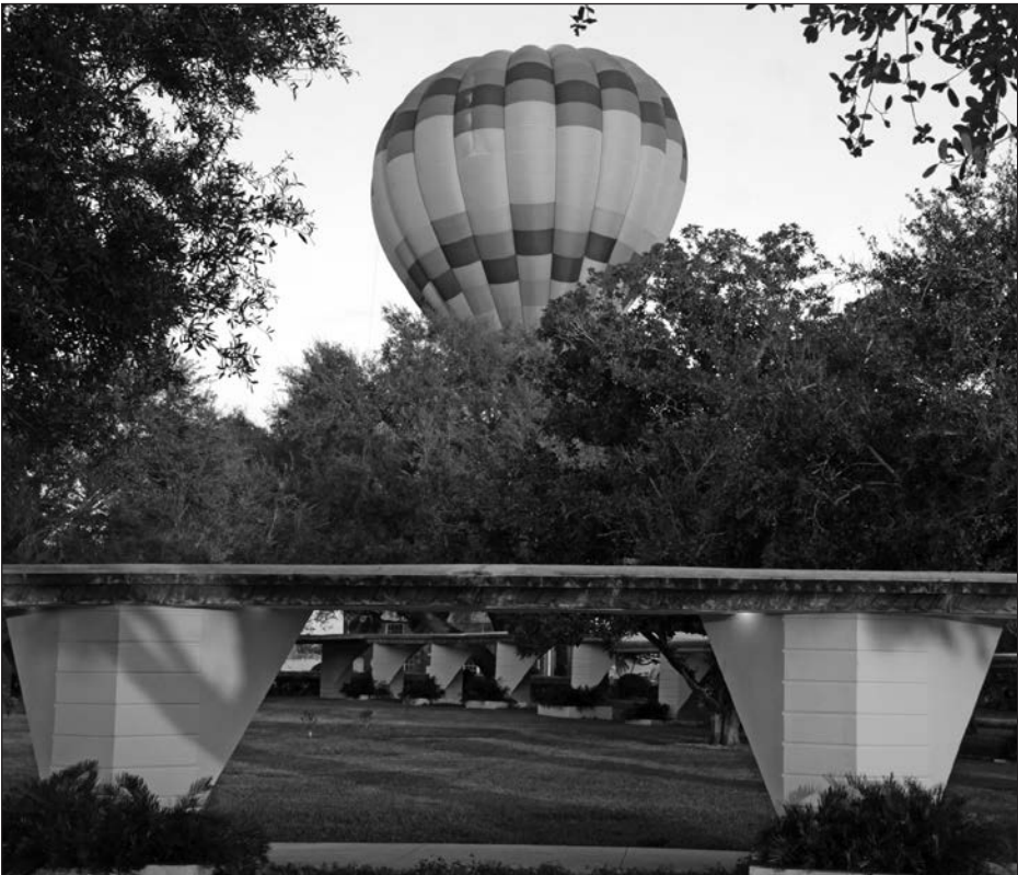
Hot air balloon rides were a treat for students during Welcome Back Week.

In regard to academic information, this edition of the Florida Southern Academic Catalog supersedes all others. The faculty and trustees of Florida Southern College reserve the right to change, modify, revoke, or add to the College's academic, financial, or student requirements or regulations at any time and without prior notice. All such changes are effective at such times as the proper authorities determine and may apply not only to prospective students but also to those who already are enrolled in the College. Provisions of this Catalog do not constitute an irrevocable contract between any student and the College.