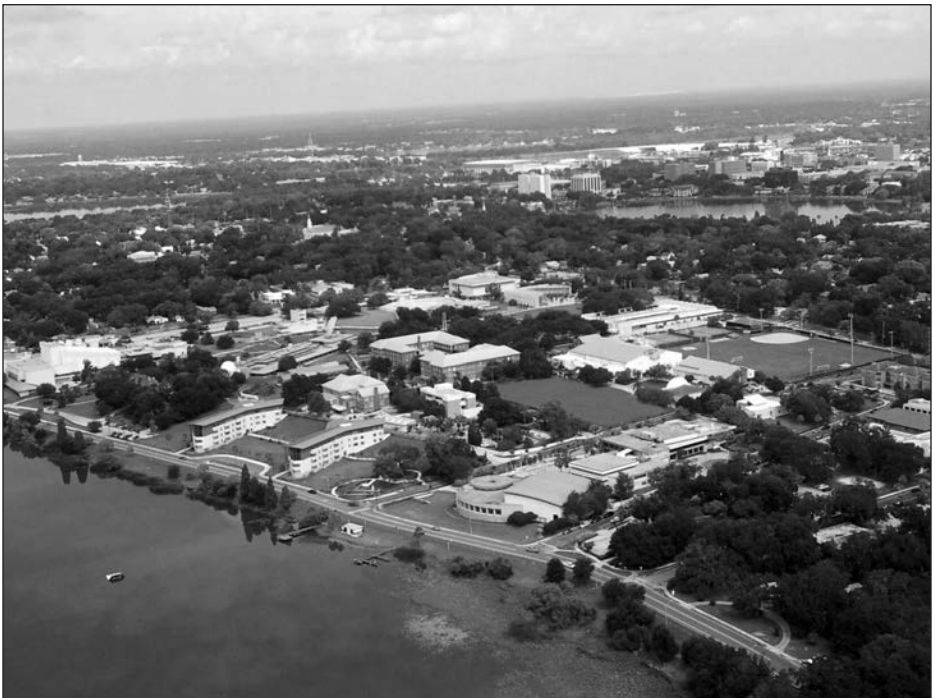
The Florida Southern College campus is bordered on the south by Lake Hollingsworth

In addition, students enjoy the recently renovated dining hall – Wynee's Bistro; the Charles T. Thrift Alumni Center; the Nina B. Hollis Wellness Center; the Jackson Religion Building; and the George Jenkins Field House. Athletic fields, intramural fields, and orange trees span the campus, as do numerous outdoor gathering spaces, including the new Mr. George's Green, the Badcock Garden, an outdoor "living room;" the more formal Glover Garden; Lynn's Garden, an environmentally sustainable garden overlooking Lake Hollingsworth; the Willis Garden of Meditation; and the Rodda Family Plaza for outdoor classes.