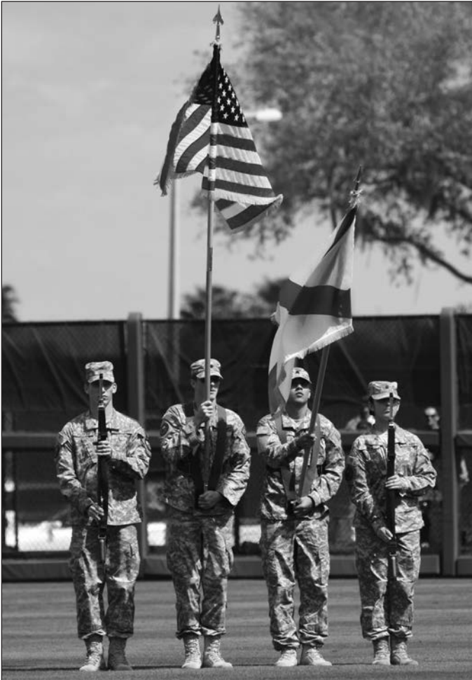
The ROTC Moccasin Battalion Color Guard presents the colors at a Detroit Tiger Spring Training game

Florida Southern College awards a military science minor for completion of all ROTC classes. Financial aid is available through the ROTC department. Qualified students may receive a monthly financial stipend ranging from $300 to $500 a month. Interested individuals may also apply for ROTC scholarships. These scholarships provide the financial assistance above, as well as full tuition and full room and board. Students attending the Leader's Training Course (LTC) and the Leadership Development Assessment Course (LDAC) also receive payment for their attendance.