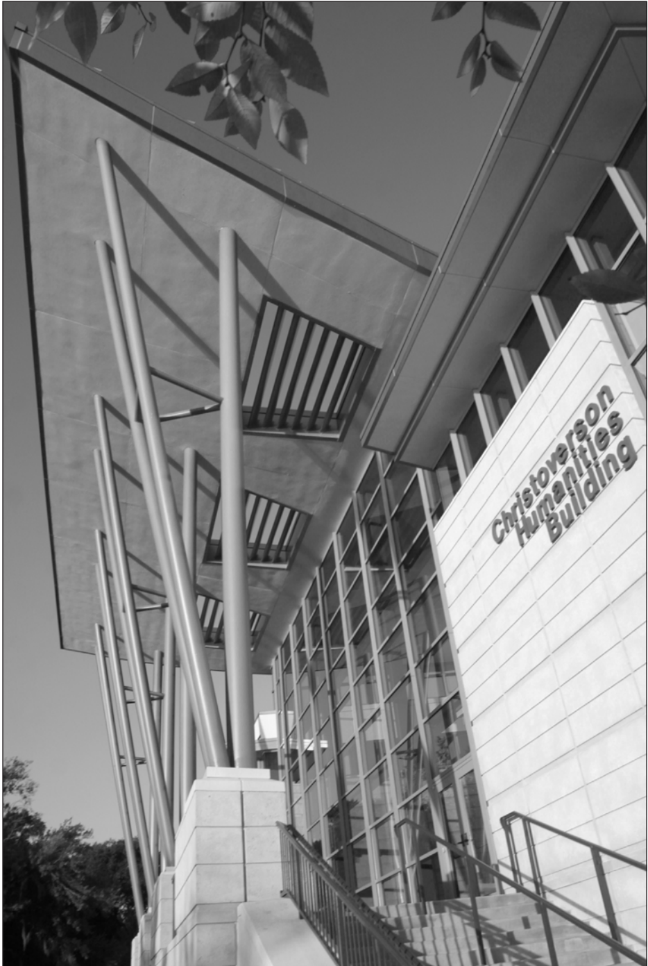
Dr. Marcene H. and Robert E. Christoverson Humanities Building