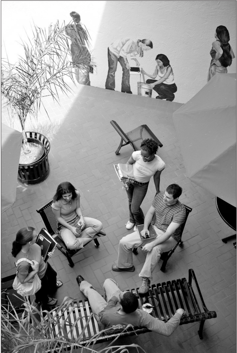
Hazel Haley Plaza in the Ludd M. Spivey Fine Arts Center