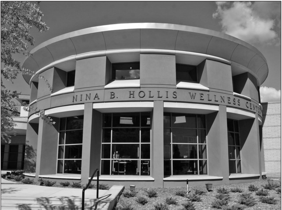
Nina B. Hollis Wellness Center